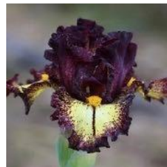
SUPERSTITIOUS - IB