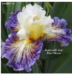
BUTTERMILK AND BLUE CHEESE