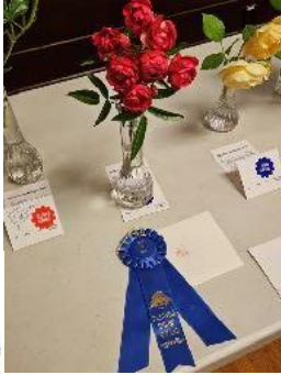
Best Rose Of the Show – Polyantha Rose

Time to brag a little...as you probably know, I belong to Healdsburg Garden Club and I am so ancient, that I don't even need to pay my dues anymore. Anyway, on Monday, May 20, 2024 they were having the Small Rose Show. I was supposed to enter two Rose Arrangements – Oriental Style Rose Arrangement and Arrangement in the Teacup. When I arrived with my small flower bucket, sweet peas and some roses, I was told to forget the Teacup, as there are no more teacups! So, I took 3 roses from my bucket and entered them in Rose Competition. After judging – I almost fell from the chair – my rose, Polyantha “Gabrielle Privat” won The Best Rose of the Show! You never know how life will treat you – and I was treated with a $ 25.00 gift certificate to Russian River Rose Company!