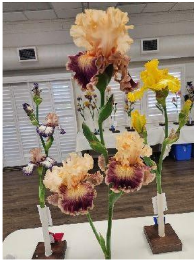
Citrus Burst, by Linnea Polo