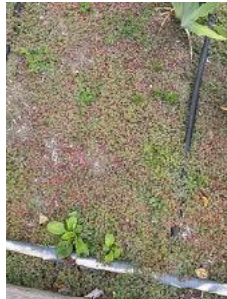
carpet of spurge before weeding