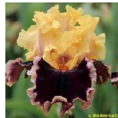
ONCE AND FOR ONE IN A