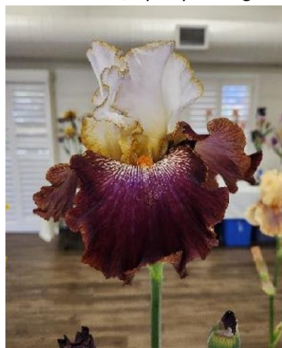
DiplomaNco, by Linnea Polo