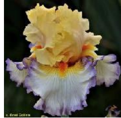
HEY Y'ALL - SDB