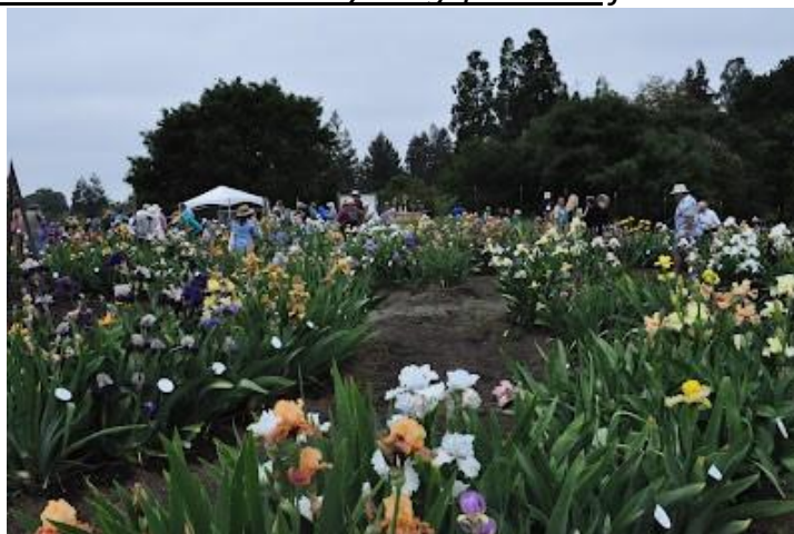
Iris garden at Dry Creek during the 2019 National.