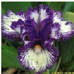
PERFECT PICK - SDB