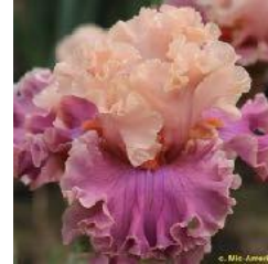
LOVE YOU SO