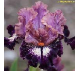
ENDORA - IB