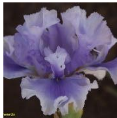
NIGHT BEFORE ALL MILLION