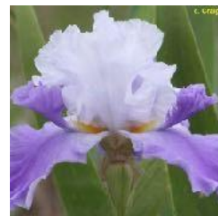
TWO OF A KIND