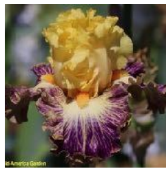
DARE TO BE DIFFERENT