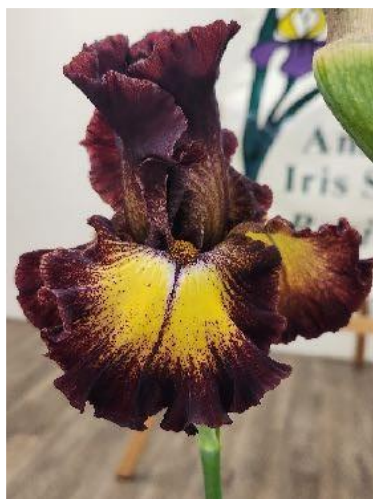
Flash Mob, by Kijy Loberg